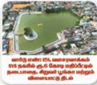
வார்டு எண் 151, வசைநகரம் 575 நகரில் கு.6 கோடி மதிப்பீட்டில் நடைபாதை, கிரைடு பூங்கா மற்றும் விளையாட்டு திடம்