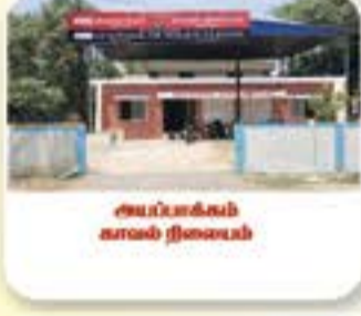
அம்பாக்கம் காலம் நகரம்