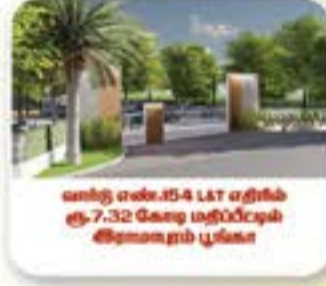
வார்டு எண் 154 L&T எதிரில் கு.7.32 கோடி மதிப்பீட்டில் கிராம நல பூங்கா