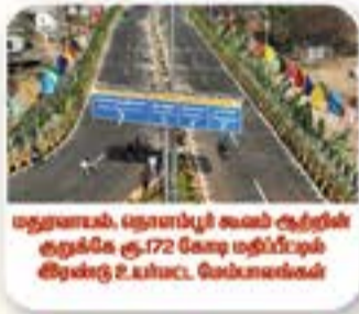
மதுரவாயல், மதுராம்புரி கூலம் ஆற்றில் குறுக்கிக் கு.172 கோடி மதிப்பீட்டில் கிரைடு உட்பட வேலைகள்

மதுரவாயல் சட்டமன்ற தொகுதியின் சாதனைகள் பல.... அவற்றில் சில