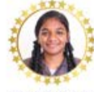
MOUSHITA M (90%)