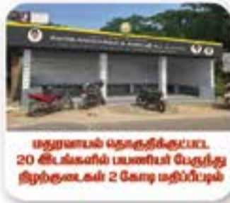
மதுரவாயல் தொகுதிக்குட்பட்ட 20 கி.மீ.காலம் பயணியர் பேருந்து நிறுத்தகம் 2 கோடி மதிப்பீட்டில்