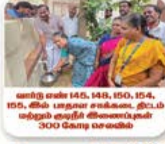
வார்டு எண் 145, 148, 150, 154, 155, ஆம் மாநகர சங்ககலை திட்டம் மற்றும் குடிநீர் விநியோகம் 300 கோடி செலவில்