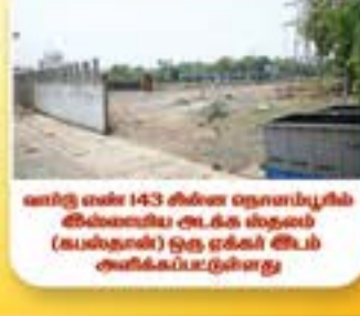
வார்டு எண் 143 சின்ன போளூர் மினிமீட்ஷேவம் (கல்வி) ஒரு கல்வி கிளம் அமைப்பதற்காக