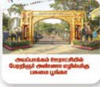
அம்பாக்கம் இராட்சியில் பேருந்து அணைப்பு கட்டுமானம் பணம் பூங்கா