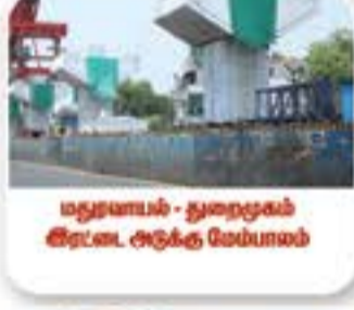
மதுரவாயல் - துறைமுகம் கிரைடு ஆரம்ப வேலைகள்