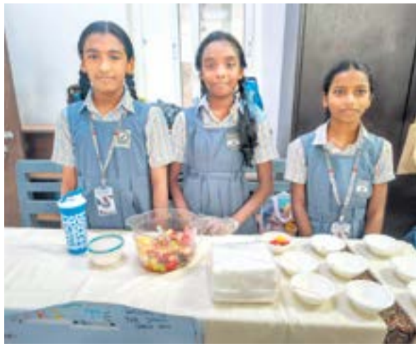
The "Beat the Heat" summer science activity was conducted with enthusiastic participation by Velammal students of classes VI to VIII.

Locals are now urging the Tamil Nadu Electricity Board and Greater Chennai Corporation to take urgent action to secure the cables, repair the damaged section, and restore the road surface. Residents warn that unless swift action is taken, the exposed cables could lead to a serious accident.