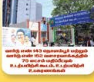
வார்டு எண் 143 மதுராம்புரி மற்றும் வார்டு எண் 152 வசைநகரத்தில் 75 ஊசல் மதிப்பீட்டில் உட்பட