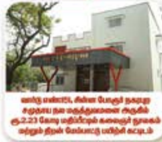
வார்டு எண் 151, சின்ன போளூர் நகராட்சி மன்றம் நடைபாதை மற்றும் கு.2.21 கோடி மதிப்பீட்டில் கலைஞர் நகரம் மற்றும் திட்டம் மேம்பாட்டு பற்றி உட்பட