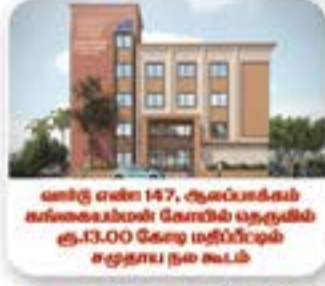
வார்டு எண் 147, அம்பாக்கம் கல்விக்கல்யாண மேலாண்மை கு.13.00 கோடி மதிப்பீட்டில் சமுதாய நல கூடம்