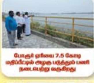
போளூர் ஞானி 7.5 கோடி மதிப்பீட்டில் அழகு பரந்த பணி நடைபெற்று வருகிறது