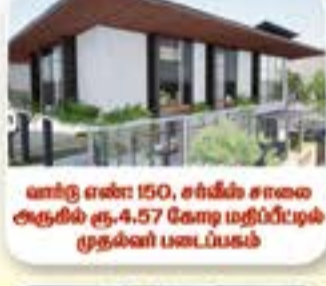
வார்டு எண் 150, சர்வீஸ் சாலை ஆரம்பிக்கும் கு.4.57 கோடி மதிப்பீட்டில் முதல் பணம்