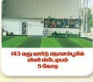
143 வது வார்டு மதுராம்புரி மினி மிட்ஷேவம் 5 கோடி