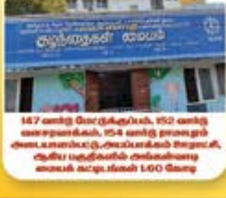
147 வார்டு போளூரில், 150 வார்டு வசைநகரம், 154 வார்டு மதுராம்புரி, அம்பாக்கம் இராட்சி, ஆரிய பகுதிகளில் அணைப்பு கட்டுமானம் 1.60 கோடி