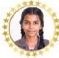
LEKA T (91%)