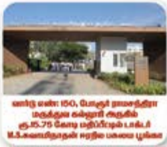
வார்டு எண் 150, போளூர் நகராட்சி மன்றத்தில் கட்டுமானம் ஆரம்பிக்கும் கு.25.75 கோடி மதிப்பீட்டில் உட்பட வேலைகள்