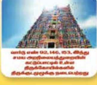
வார்டு எண் 152, 146, 153, கிழக்கு சமீப அழகு பரந்த பணிகள் கட்டுமானம் உட்பட