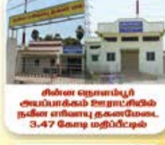
சின்ன போளூர் அம்பாக்கம் இராட்சியில் நவீன ஞானியு தகவல்மேடை 3.47 கோடி மதிப்பீட்டில்