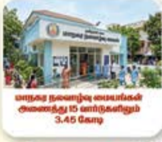
மாநகர நகராட்சி செயலகம் அமைத்து 15 வார்டுகளிலும் 3.45 கோடி