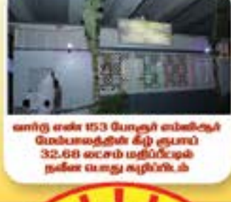
வார்டு எண் 153 போளூர் மினிமீட்ஷேவம் கட்டுமானம் கு.32.68 கோடி மதிப்பீட்டில் நவீன வசது ஆரம்பிக்கும்