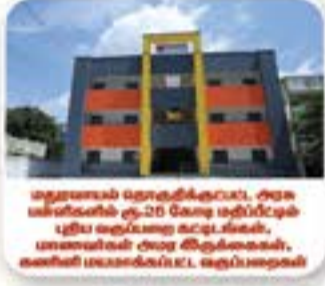
மதுரவாயல் தொகுதிக்குட்பட்ட, குடிசை கட்டுமானம் கு.28 கோடி மதிப்பீட்டில் பூங்கா மற்றும் கட்டிடங்கள், மாணவிகள் குடிசை கட்டுமானம், கணினி மையம் உட்பட