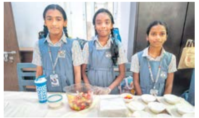
The "Beat the Heat" summer science activity was conducted with enthusiastic participation by Velammal students of classes VI to VIII.

This time who will emerge as victor shall be known on May 4 when the votes polled on April 23 are counted.