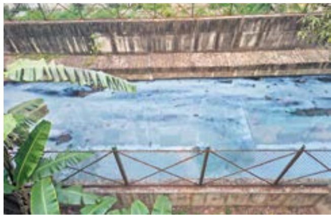
Untreated waste is systematically dumped into the canal after 8 a.m.

UNTREATED sewage is being illegally discharged into the Mogappair Eri Scheme canals daily, causing a severe stench and health concerns for local residents.