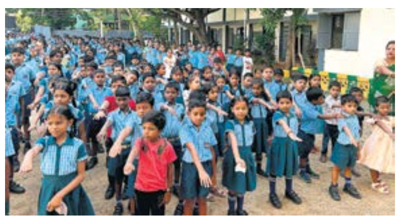
World Environment Day 2025 was observed at CSI Ewart Matric Hr. Sec. School, Anna Nagar West Extn on June 5. The theme "Beat plastic pollution" was brought out effectively by students of all classes taking the oath. They also participated in a drawing and painting competition. Students were taken out on a rally on the streets around the school as they carried banners and placards to emphasize the theme.

From July 1, only users who have authenticated their IRCTC account with Aadhaar will be able to book Tatkal tickets through its website and app. To make the process more fool-proof, the use of OTP for Aadhaar authentication will be introduced from July 15, says a press release from the Railways. The new norms have been notified to check malpractices by agents and ensure that only genuine passengers benefit from the Tatkal scheme. The ministry has urged people to ensure Aadhaar linkage with their IRCTC user profiles to avoid inconvenience. Even to buy paper tickets at the railway counters from July 15, passengers or their representatives will have to provide a mobile number on which an OTP will be sent for verification purposes. Provisions have also been made to ensure that by using other software no one can book tickets faster than genuine users. Authorised ticketing agents will not be permitted to book opening-day Tatkal tickets during the first 30 minutes of the booking window. For AC classes, this restriction will apply from 10a.m to 10.30a.m, and for non AC classes, from 11a.m to 11:30a.m.