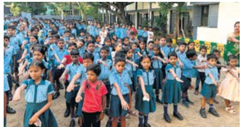
World Environment Day 2025 was observed at CSI Ewart Matric Hr. Sec. School, Anna Nagar West Extn on June 5. The theme "Beat plastic pollution" was brought out effectively by students of all classes taking the oath. They also participated in a drawing and painting competition. Students were taken out on a rally on the streets around the school as they carried banners and placards to emphasize the theme.

From July 1, only users who have authenticated their IRCTC account with Aadhaar will be able to book Tatkal tickets through its website and app. To make the process more fool-proof, the use of OTP for Aadhaar authentication will be introduced from July 15, says a press release from the Railways. The new norms have been notified to check malpractices by agents and ensure that only genuine passengers benefit from the Tatkal scheme. The ministry has urged people to ensure Aadhaar linkage with their IRCTC user profiles to avoid inconvenience. Even to buy paper tickets at the railway counters from July 15, passengers or their representatives will have to provide a mobile number on which an OTP will be sent for verification purposes. Provisions have also been made to ensure that by using other software no one can book tickets faster than genuine users. Authorised ticketing agents will not be permitted to book opening-day Tatkal tickets during the first 30 minutes of the booking window. For AC classes, this restriction will apply from 10a.m to 10.30a.m, and for non AC classes, from 11a.m to 11:30a.m.