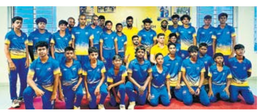
One for the album: Super Kings Academy boys with the CSK players

The evening commenced with a practice session at the Academy nets, where students had