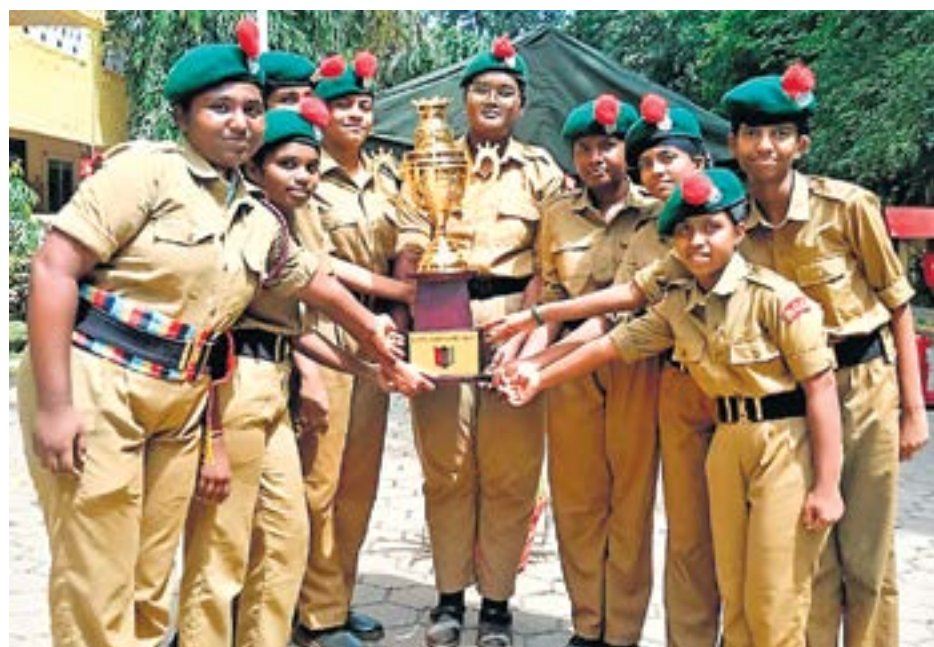
The NCC Army Cadets of Velammal Vidyalaya West actively participated in the NCC camp held at Velammal Matriculation Hr.Sec.School, Panchetti and won many awards.

students for the supplementary exam and to achieve the best results." It was also noted that compared to last year's 6,000, the enrollment for the upcoming academic year across 420 corporation-run schools has surpassed 16,000 and may reach beyond 18,000.