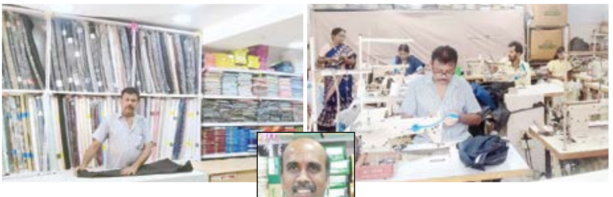
By Our Correspondent

"It is said that most successful entrepreneurs are excellent salespersons but not all excellent salespersons are successful entrepreneurs".