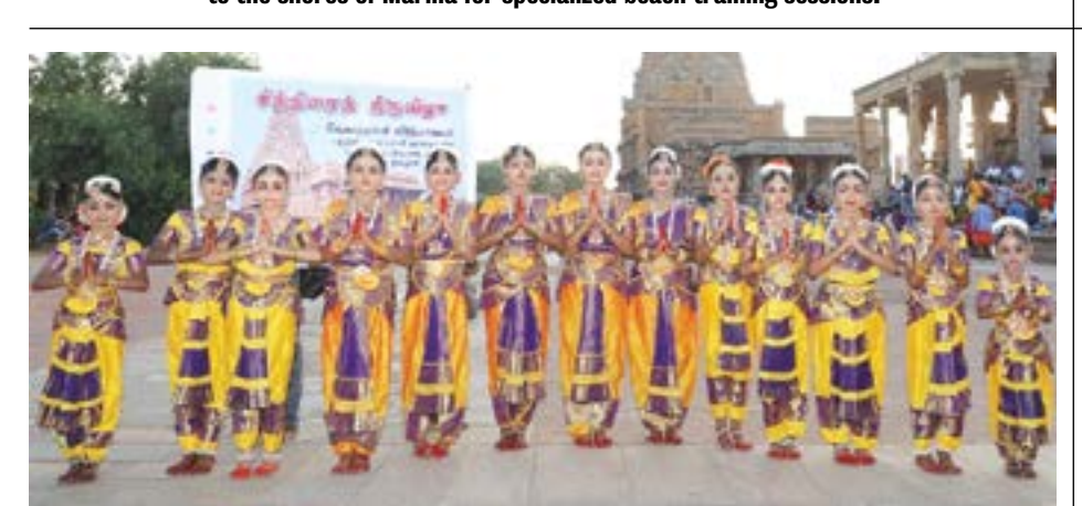
In a captivating display of grace and tradition, Velammal Vidyalaya Paruthipattu showcased a mesmerizing classical dance performance at the revered Thaniai Periva Kovil during the Chitherai Thiruvizha.