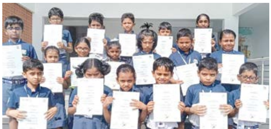
Students from Velammal Academy, Nolambur showcased exceptional language proficiency by excelling in the Cambridge University Young Learners of English (YLE) examinations.