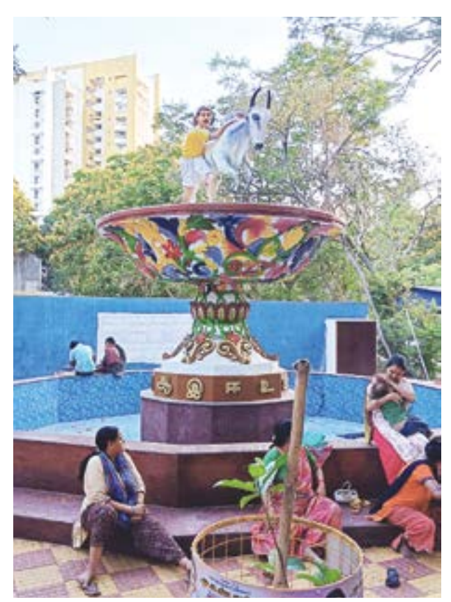
By N Rathi Chithra

In the heart of the Anna Nagar Western Extension neighbourhood, a unique water fountain has emerged as a captivating attraction at the Millennium Park on Park Road. Featuring a figurine depicting the ancient sport of jallikattu, where a man courageously clings to the hump of a raging bull, the fountain has garnered attention and admiration from park-goers. The statue not only