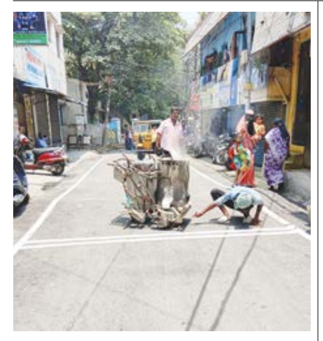
The roads of Mogappair seem to have a brighter look with the road marking works undertaken by the GCC. A worker is busy at the Veeramamunivar Street in Mogappair East.