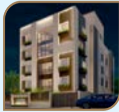
Firm's Thayagam AH-Block, Anna Nagar 1504 | 1314 SQ.FT | 3 BHK