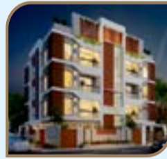
Firm's Tranquil AK-Block, Anna Nagar 1450 SQ.FT | 3 BHK