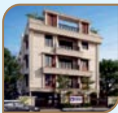
Firm's Tamil Illam Periyar Nagar, Korattur 1525 SQ.FT | 3 BHK