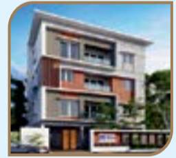
Firm's Maniyagam W-Block, Anna Nagar West 1275 SQ.FT | 3 BHK