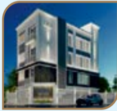
Firm's Sai Aashirwad L-Block, Anna Nagar East 1485 SQ.FT | 3 BHK