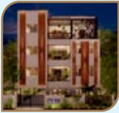
Firm's Rathnam AH-Block, Anna Nagar 1454 SQ.FT | 3 BHK