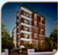
Firm's K.K.Pillay's Kasturibai Nagar, Adyar 2429 SQ.FT | 4 BHK RERA : TN/29/Building/024/2024

Inviting Landowner's for a Profitable Joint Venture / Construction