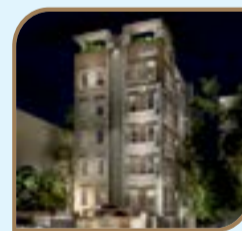
Firm's Samarpan K.K.Nagar 1130 SQ.FT | 3 BHK