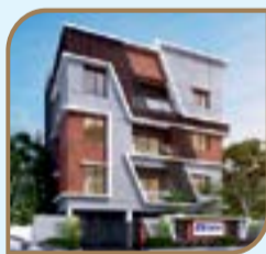
Firm's Malliga Illam TNHB, Korattur 1440 | 1230 SQ.FT | 3 BHK