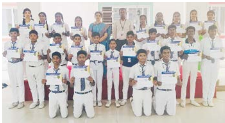
Velammal Vidyalaya Annexure recognized the achievements of its Road Patrol Safety (RSP) students who successfully completed a year-long course dedicated to enhancing awareness and promoting safety on the roads.